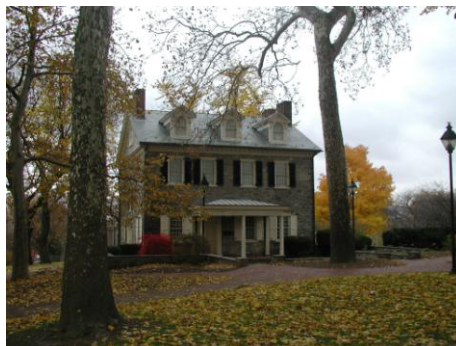
Trout Hall, completed eight years after the community was first settled, was built as a summer home by James All, son of the city's founder, William Allen.

In 2012, the City of Allentown will mark a monumental milestone- its 250 th anniversary, or Semiquincentennial. Like our nation, our city has grown and changed during its long history. Beginning as a small village along Trout Creek, Allentown has evolved the third largest metropolitan area in the Commonwealth. Allentown's 250 th celebrates our rich history, the present day revitalization, and ever more promising future.